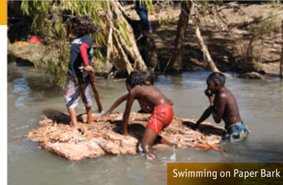
Swimming on Paper Bark