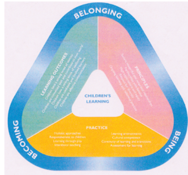
Elements of the Early Years Learning Framework

Every child needs guidance through a map of their personal identity, in order to feel safe in their 'skin' and to feel good about who they are. In order to support Aboriginal and Torres Strait Islander children's cultural needs, we need to understand that culture is a powerful force that helps to 'grow up' the child.