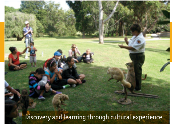
Discovery and learning through cultural experience