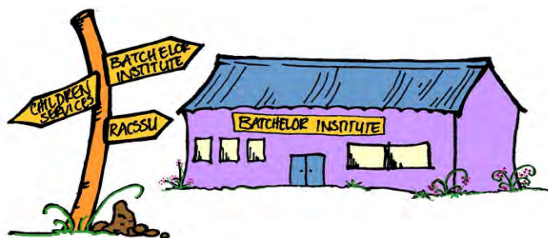
Batchelor Institute stores all photos in a secure filing system.

Organisations must be careful to respect your privacy. If an organisation collects information about you, it must protect the privacy of your information. This means it must keep your details private, so that not everyone can see or have your personal information. Organisations must follow the government privacy principles and laws about how personal information can be collected, stored or used.