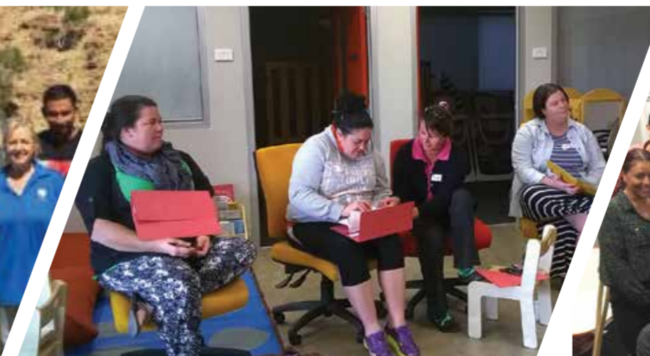
Journey to Big School workshop participants

SNAICC wishes all children every success on their educational journey and a special mention to those children heading off to big school!