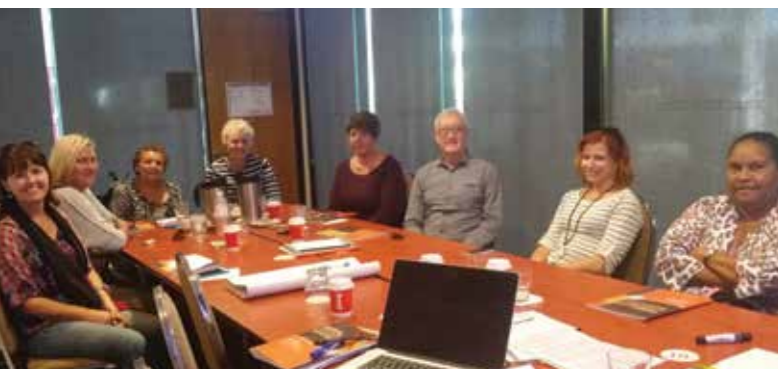
Opening Doors to Genuine Partnerships workshop participants, Townsville QLD

If you are interested in hosting a workshop for your organisation, please call the SNAICC Training team to see how we can meet your training needs. E: training@snaicc.org.au T: 03 9489 8099