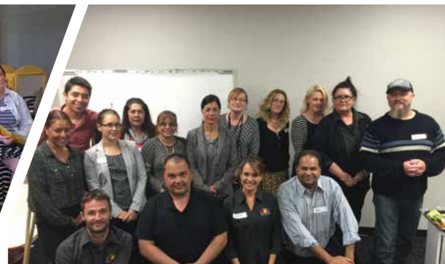
Recognising and Responding to Trauma workshop participants in Adelaide, SA

SNAICC's Recognising and Responding to Trauma workshop looks at trauma and understanding it's impacts, and builds understanding of trauma-informed approaches to healing and working with Aboriginal and Torres Strait Islander children, families and communities. In collaboration with VACCA, SNAICC delivered workshops in Lismore (NSW), Adelaide (SA) and the Tiwi Islands (NT). It was pleasing to be able to deliver in an urban, regional and remote setting. The workshops were adjusted accordingly, particularly by drawing from the existing strengths in each community. The workshops received positive responses, with a highlight being the opportunity for workers to come together to share their practices and stories with each other. SNAICC is looking forward to delivering more workshops before the year comes to a close.