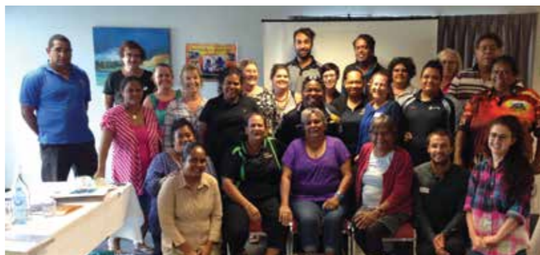
TYBE participants in Mackay, QLD

Based on the SNAICC Partnership Audit Tool and Training Manual, the first of the Opening Doors to Genuine Partnerships workshops were delivered throughout Queensland from May to August 2015. SNAICC partnered with Queensland Aboriginal and Torres Strait Islander Child Protection Peak (QATSICPP) to run seven workshops, focusing on supporting and sustaining genuine inter-agency partnerships in service delivery for Aboriginal and Torres Strait Islander children and families. Various mainstream and Aboriginal and Torres Strait Islander Community-controlled organisations participated in the training to explore ways of working together to implement the Family and Child Connect initiative that is about connecting families in Queensland to early intervention supports. A major focus for the training was to ensure community-controlled organisations have a leading role to support engagement and culturally appropriate support for Aboriginal and Torres Strait Islander families. SNAICC will conduct follow-up workshops to further progress partnership agreements and work in each of the Queensland sites in November 2015.