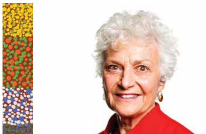
Professor Fiona Stanley