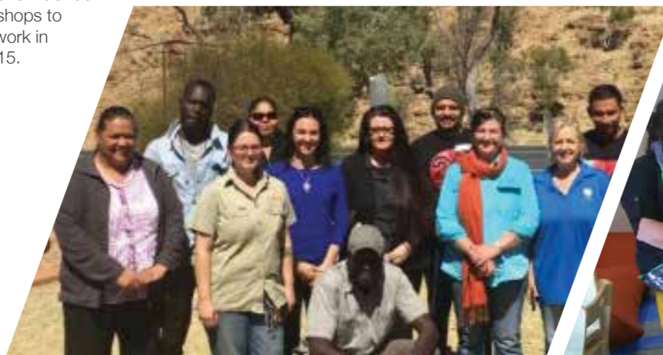
TYBE participants in Alice Springs, NT

SNAICC's Through Young Black Eyes Family Violence train-the-trainer has continued to be an extremely popular workshop, with the team delivering more than ten workshops around the country. The Through Young Black Eyes (TYBE) workshop is designed to help you learn to use the TYBE resource kit to run your own workshops on family violence, abuse and neglect and helping to keep Aboriginal and Torres Strait Islander children in your community safe. Since February, family violence, family support, health and community workers have participated in the workshops in: Alice Springs, Darwin and Tennant Creek (NT); Walgett, Dubbo, Broken Hill, Dareton and Bourke (NSW); Port Augusta and Adelaide (SA); and Mackay (QLD).