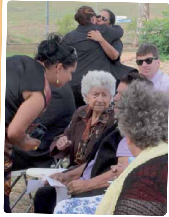
Community members from Dubbo. Wellington and Narromine were present to witness the signing of the partnership agreement between Ngurambang OOHC Service and Uniting Care CUPF.

For new ACCOs, like any fledgling organisation, establishment costs can be a major barrier to getting the service up and running and surviving early stages of operation. Funding for a partnership project manager within the auspice organisation provides critical support for an ongoing focus on partnership goals. However, partnership funding is predominantly linked to placements on a unit cost basis and there is limited further establishment funding built into the model. Resource and staff-sharing and co-location of services within the partnership can help to reduce start-up costs. There is, however, a significant risk to transitioning to independent service operation where ACCOs lack necessary capital resources, and non-Indigenous agencies lack dedicated-resources for supporting their ongoing development.