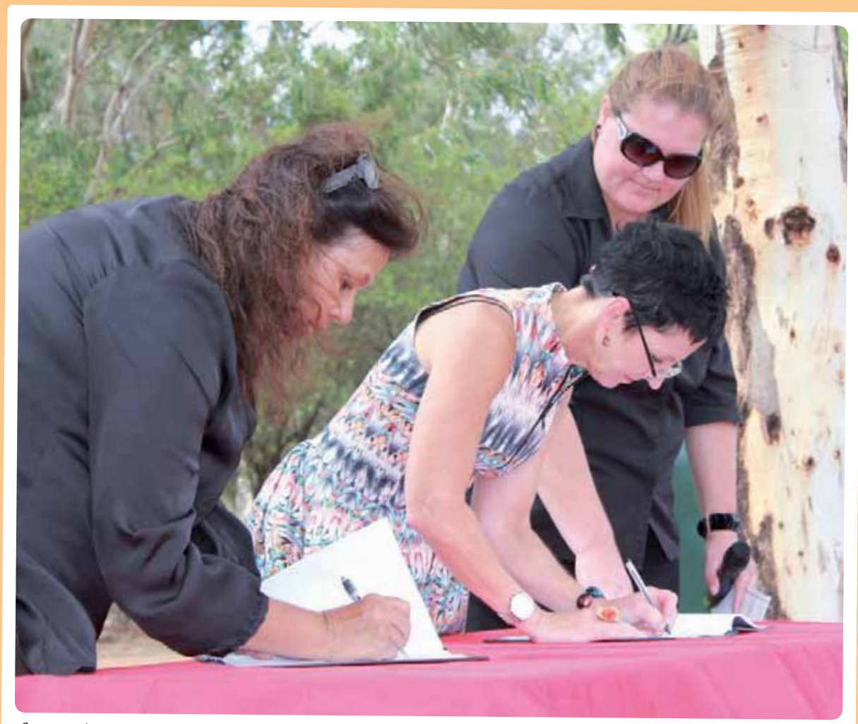
Signing the partnership agreement between Ngurambang OOHC service and Uniting Care CYPF.