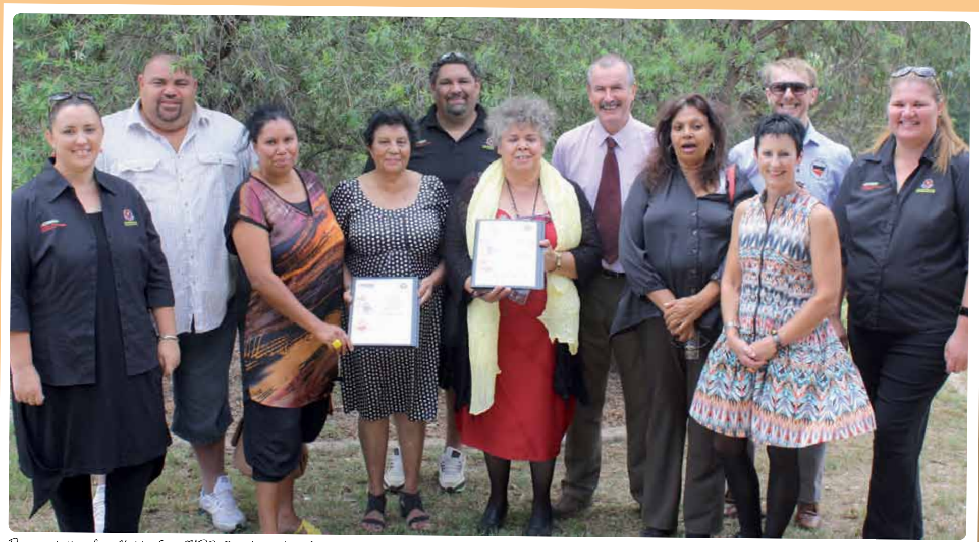
Representatives from UnitingCare CYPF, Board members from Ngurambang OOHC Service and AbSec on the day of signing the partnership agreement.