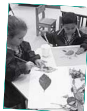
The photos on this page show the breadth of activities at TACCA: from gathering kelp (main photo) and acorns to make traditional artefacts such as bags, necklaces and collages (bottom photo), to challenging outdoor activities (top photo) and exploring the individual abilities of children (middle photos).

“Parents and carers are learning to recognise the learning styles of their children which is supporting the children’s learning, not only in the centre but in the home and the community.”