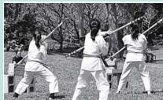
A karate demonstration was part of the SAF,T family day activities at Jingili Water Gardens in Darwin.

She said international criticism of Australia's efforts to protect the rights of children should be a rallying call for governments to act urgently and decisively.