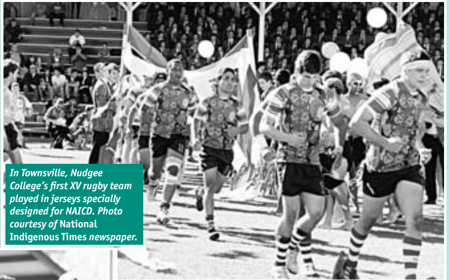
In Townsville, Nudgee College's first XV rugby team played in jerseys specially designed for NAICD.