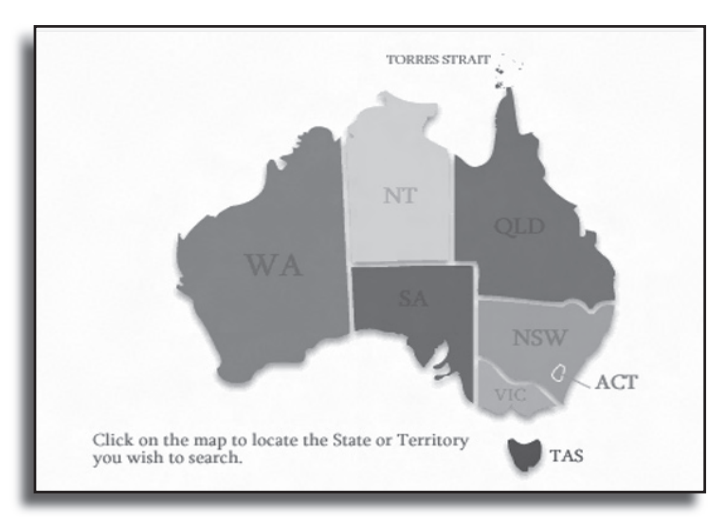
The online National Service Directory allows anyone to search for relevant family and children's services in any state or territory across Australia. Go to www.snaicc.asn.au and click on 'Service Directory' on the navigation bar to start your online search.

As part of the Capacity Building initiative, Infoxchange Australia has also developed a community networking section for SNAICC's website, aimed at encouraging an online community in our sector.