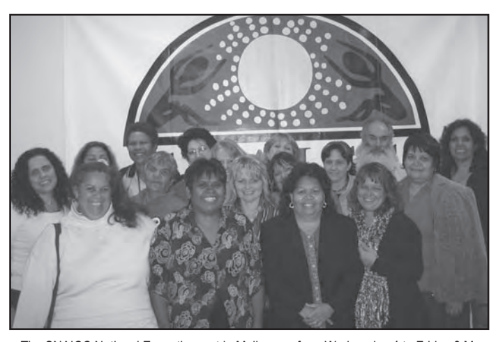
The SNAICC National Executive met in Melbourne from Wednesday 4 to Friday 6 May.

The priorities for SNAICC include working to ensure that communities are empowered to negotiate Shared Responsibility Agreements that address the needs of children – particularly in relation to child development and the prevention of abuse or neglect.